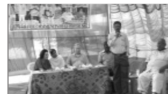
MEO-speaking at the occasion