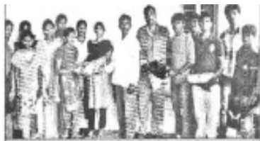
Gifts are given away to the DO's