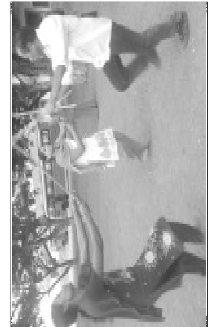
Scenes taken from various cultural leadership training of Bala Bata held at Deenapur on January 15 th 16 th and 17 th