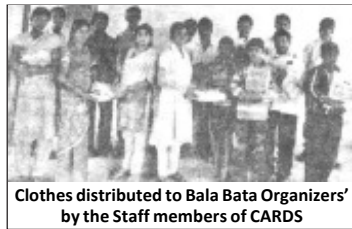
Clothes distributed to Bala Bata Organizers' by the Staff members of CARDS