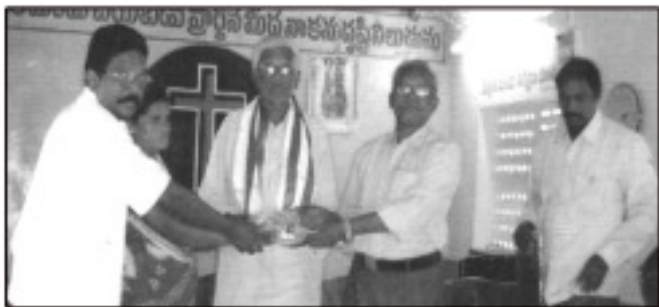
EENADU: 12.12.13 Thursday.